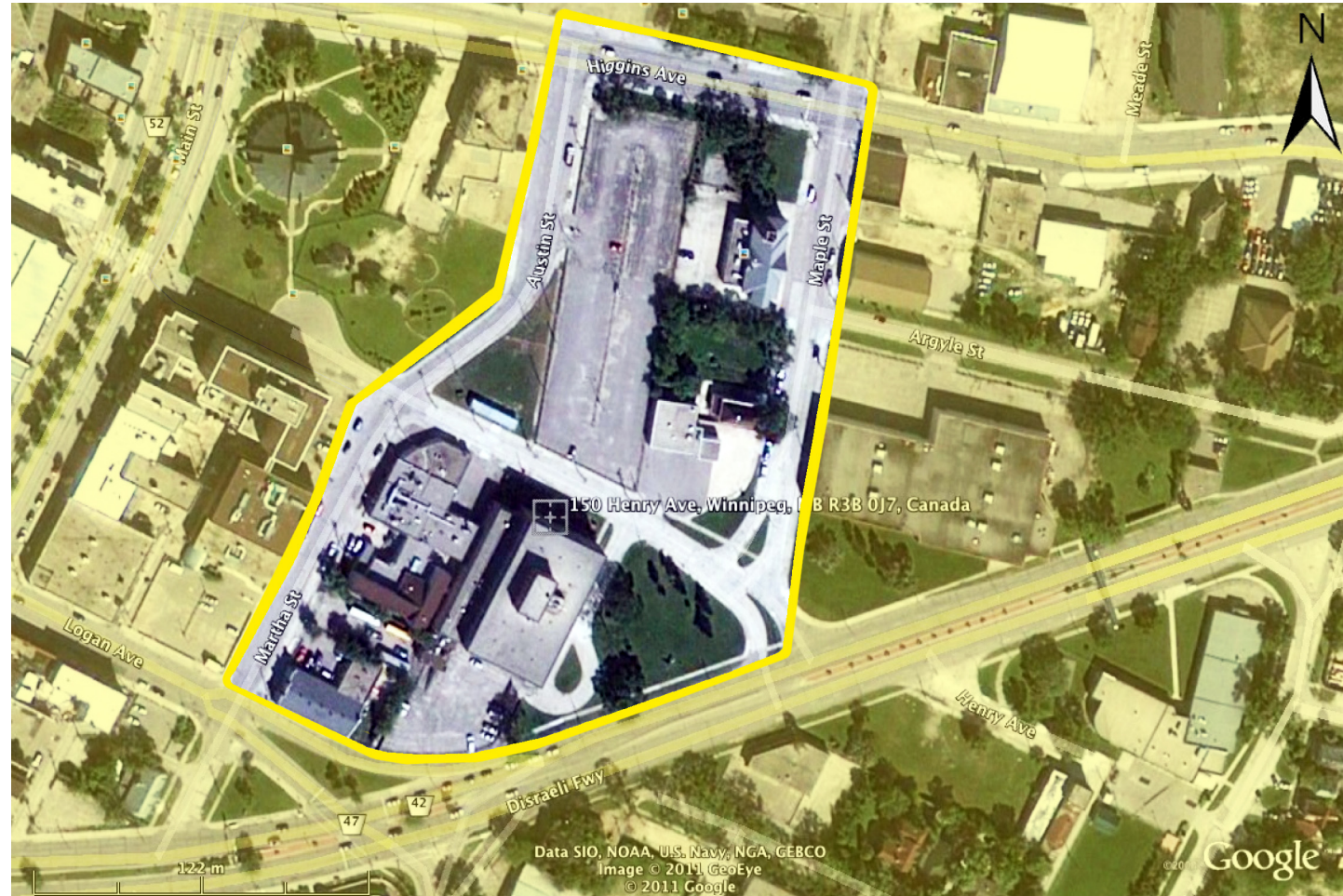
150 Henry Avenue can be the catalyst for redevelopment in the Point Douglas Area.