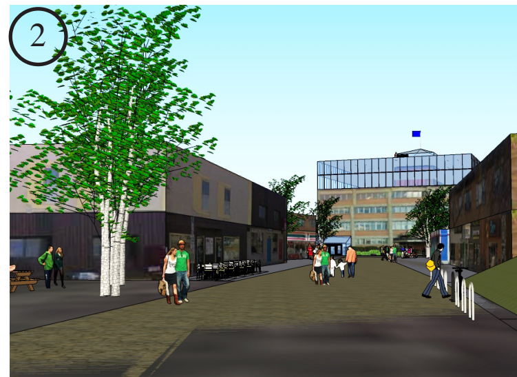
Pedestrian view looking South along new developments consisting of mixed use buildings and walkable environments.