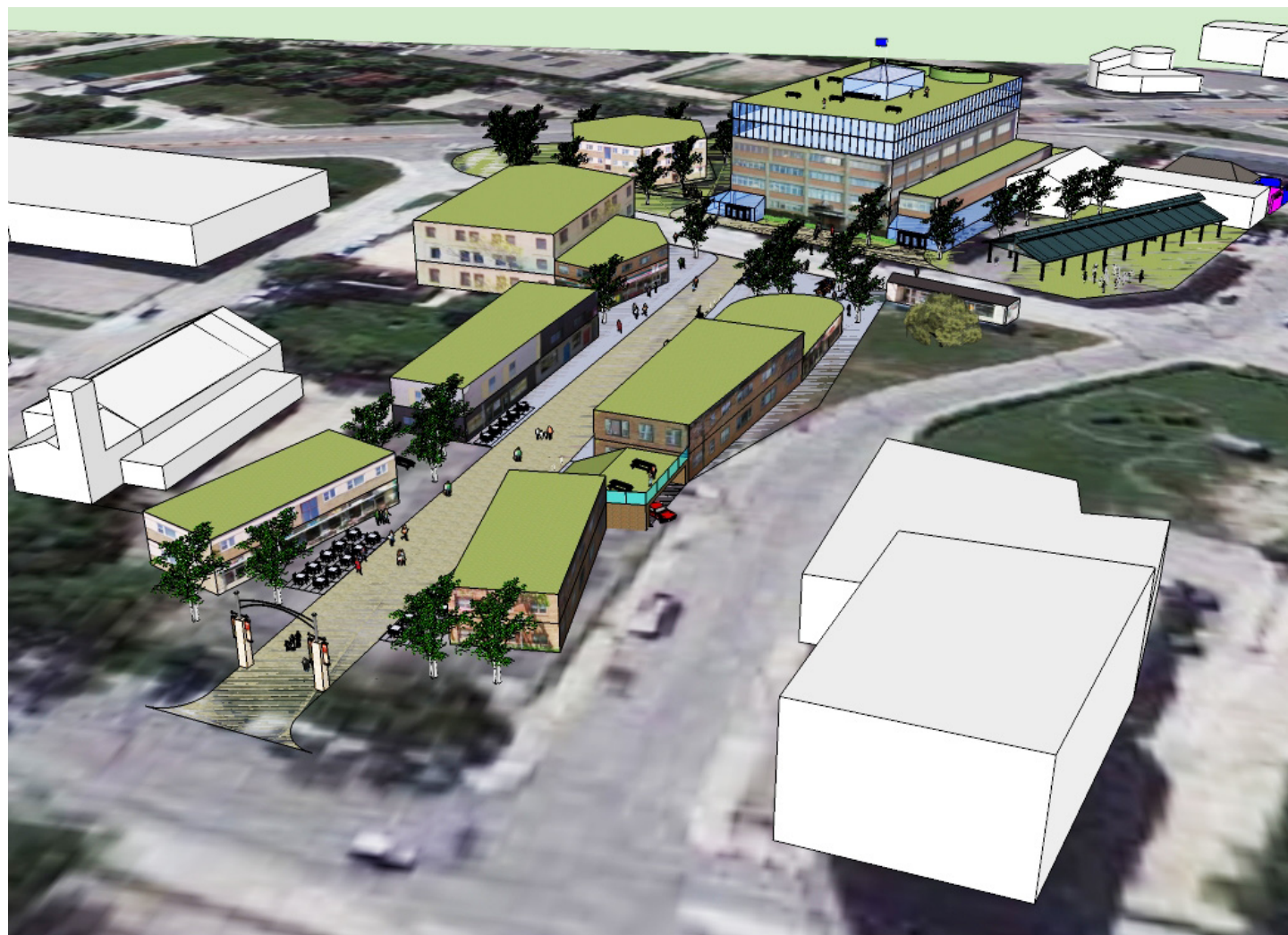
Sky View of Point Douglas redevelopment showing such features as underground parking, pavillion with green space for events such as a farmers market, mixed-use walkable environments, green roofing, etc...