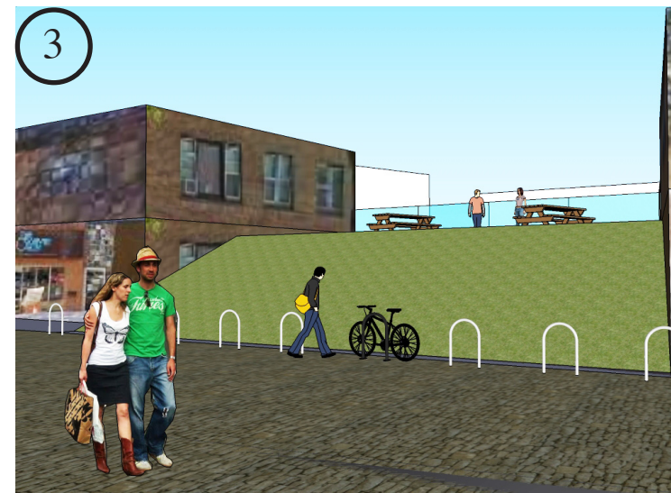
Pedestrian view of greenspace on the top of underground parking structure.