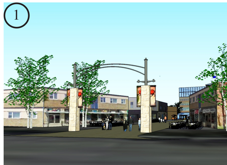
Pedestrian view looking South From Higgins Ave.