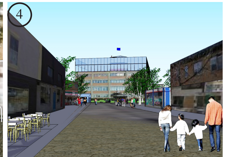
Pedestrian view looking South towards 150 Henry Ave.